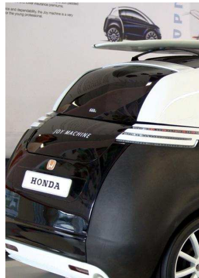
Figure 1: Student car design

In this example there is also the wider dimension that will rarely apply to the written essay. Outputs from Art and Design courses are often of wide, public interest, photogenic and thus much used by those marketing Universities, Departments and Courses.