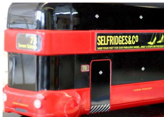
Figure 2: Student Bus Design

An extension of this issue concerns not the design itself but the context in which it is placed. A student designing a bus shelter or pub/club interior might wish to include reproductions of existing advertisements and products to "complete" the presentation of their design. To what extent is this intended to go beyond simple adornment and enrichment to the imparting of a specific feel or emotional response? Does the student, for example, include a poster for a desirable rock band on the bus shelter they have created or a "weight-watchers" poster? Does the model of a bar interior clearly display common or exclusive bands of alcohol?