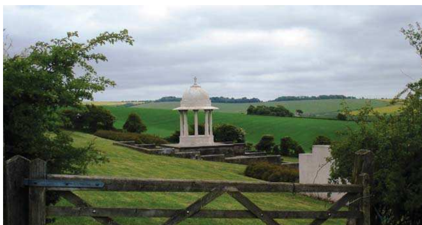
Figure 1. Chattri Indian Memorial site north of Brighton on the Sussex Downs.