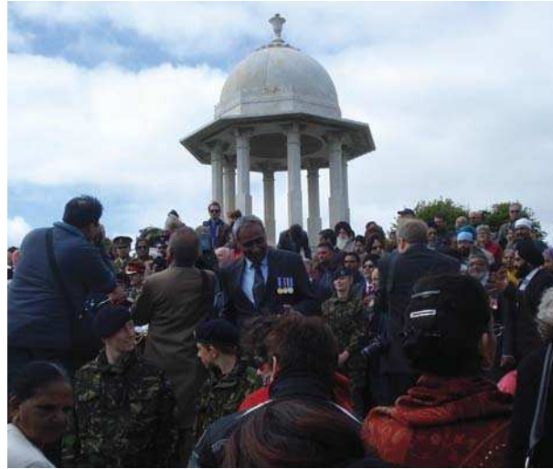
Figure 5. Participants converge on the steps of the memorial for a final group photo, June 2013.

emotional memories of historical experiences particular to India, not necessarily connected to the Chattri, which they perceived as a time of unity and belonging within their community: