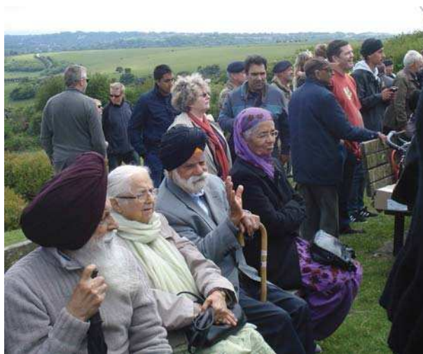
Figure 4. Participants assemble before the Chattri Memorial ceremony, June 2013.

What's really nice is no matter what's the weather, you'll still have a good turnout.... people still trek up there in their wellies or whatever, in their raincoats and wellies.... If I miss it, I feel quite guilty that I have missed it. I think that the first time I went, I went because my mom goes and I have to go and support this. Now it's something I take my children to. (Interview M, March 26, 2014)