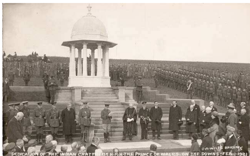
Figure 2. Chattri Memorial dedication ceremony, Brighton, 1921.

This memorial’s original valuation was thus based on its function as an imperial gesture in the wake of World War I. However the maintenance of historical value depends on continued enactments of rituals of remembrance. Instead, the Chattri was abandoned by the government after its unveiling,