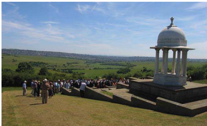
Figure 3. Chattri Memorial ceremony, June 2005.

presence of a military motorcycle group in leather regalia, bearing witness and expressing solidarity with war dead, added to the heterogeneous sensibility of the space. Assorted audiences come from across the country – Indian descendants, local residents, Black history enthusiasts and ethnic organisations mixed with official invitees, which grew after 2000 to include the Queen’s representative, the local Marquis, and the Indian High Command: