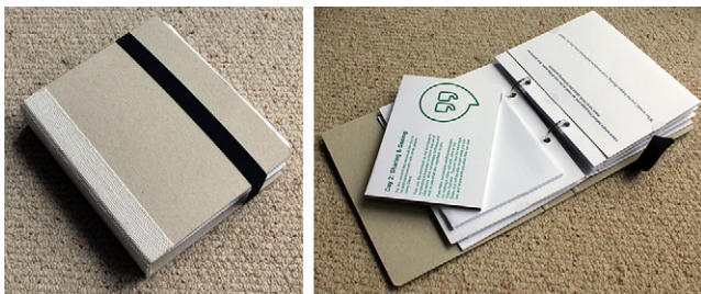
Figure 1. Diary given to participants for field trial in phase 2 of the study, closed (left) and open (right).

The second stage of the study involved a co-design session with each participant at the end of their field trial. We used participants' diaries to structure these sessions, where design activities were built into hidden compartments on each page (Fig. 2). Each activity was designed to support reflection on