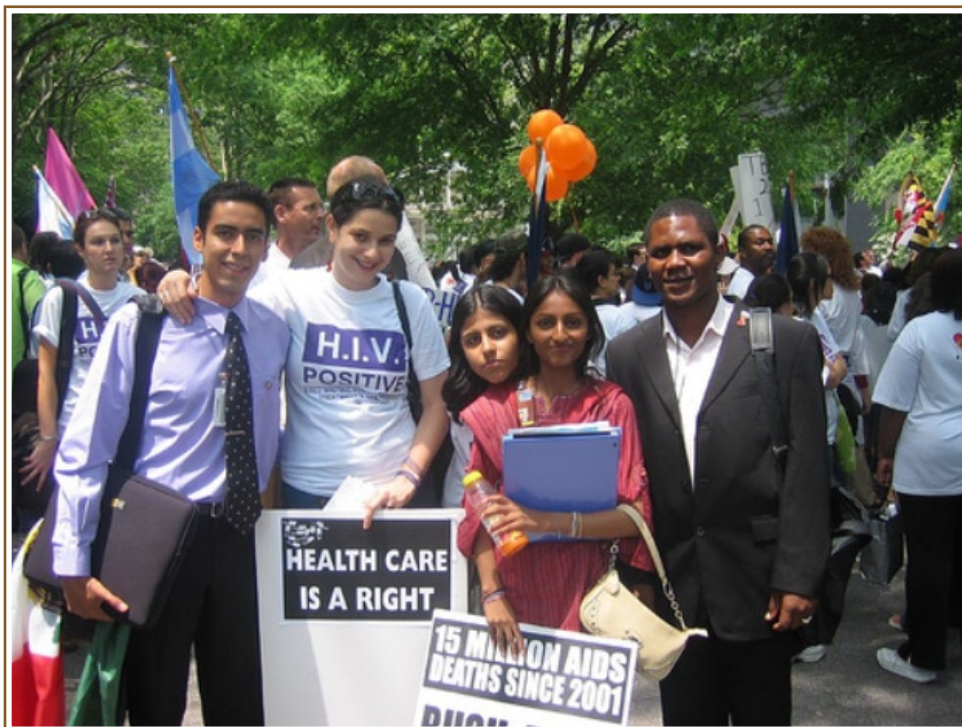
Youth activists at UNGASS, 2006.

Although these youth initiatives were having a positive impact on an ad-hoc basis, it was clear that the efforts lacked synergy, thereby diminishing the overall impact. Youth activists decided that there was an increasing need for a coalition that would bring these assorted initiatives under one umbrella, streamline their endeavors, and empower them with the necessary technical resources to create a noticeable, large-scale impact.