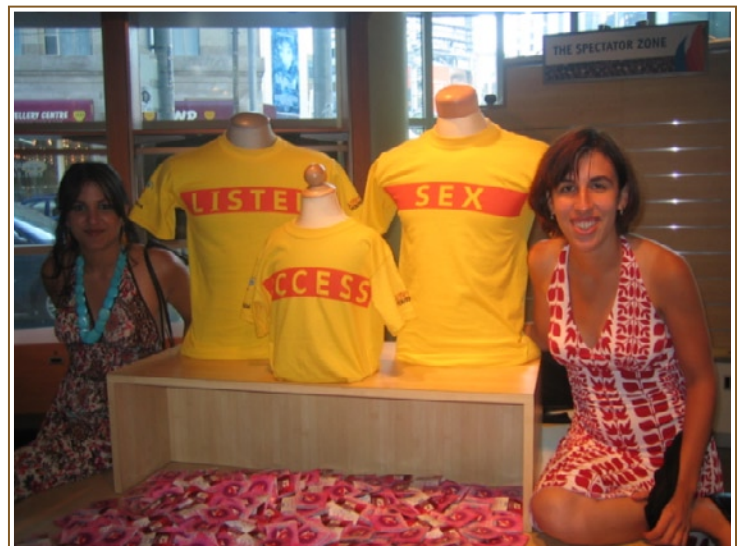
GYCA members communicate their agenda at IAC, 2006.