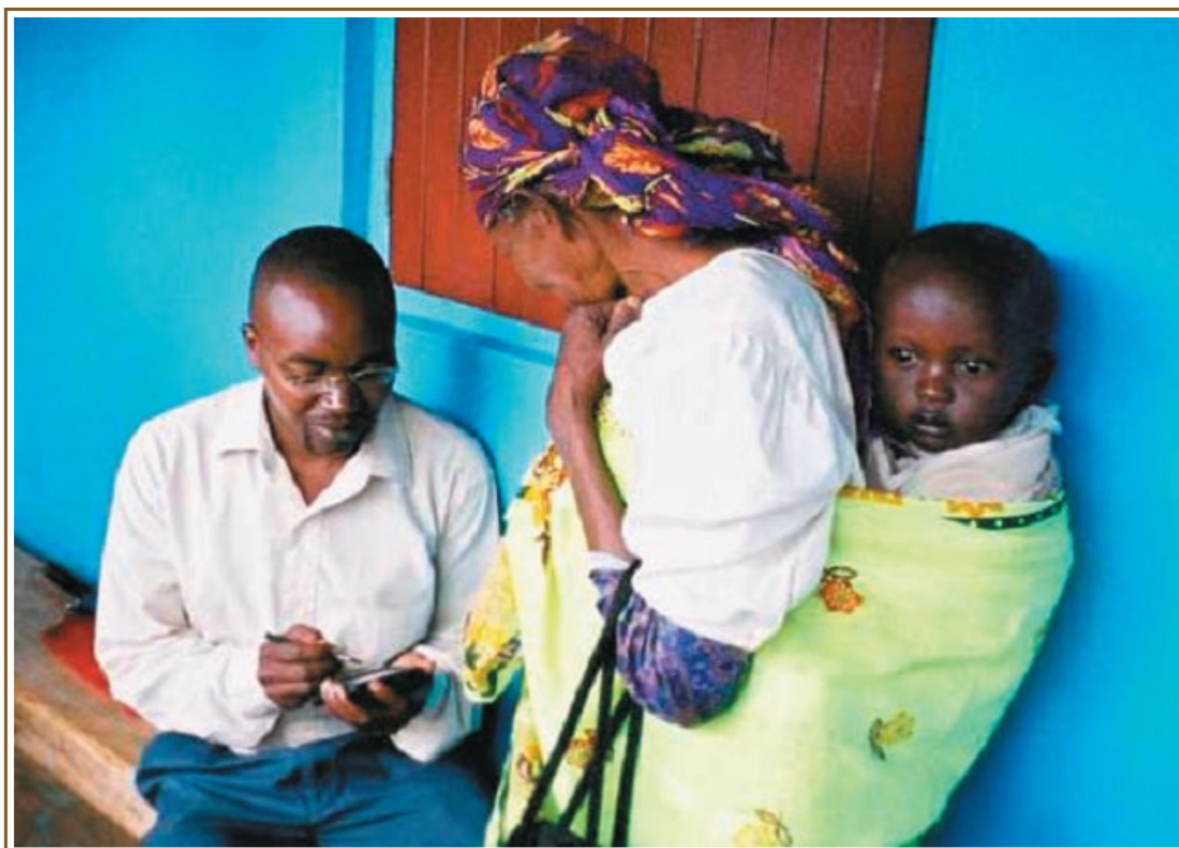
A health worker in Uganda uses a handheld device.

In Uganda, the Satellife project used handheld devices to disseminate health information, conduct surveillance, and monitor and evaluate health programs. 5 Mobile phones have been used to address asthma, diabetes, cardiovascular disease and HIV/AIDS in Croatia, Finland, Spain and South Africa,