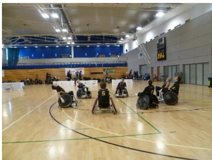
(Figure 6. Mark preparing for a match with his teammates, photograph shared with us)

Mark's discussion of the photograph produced a very different figure to the disabled figure to be charitable towards: