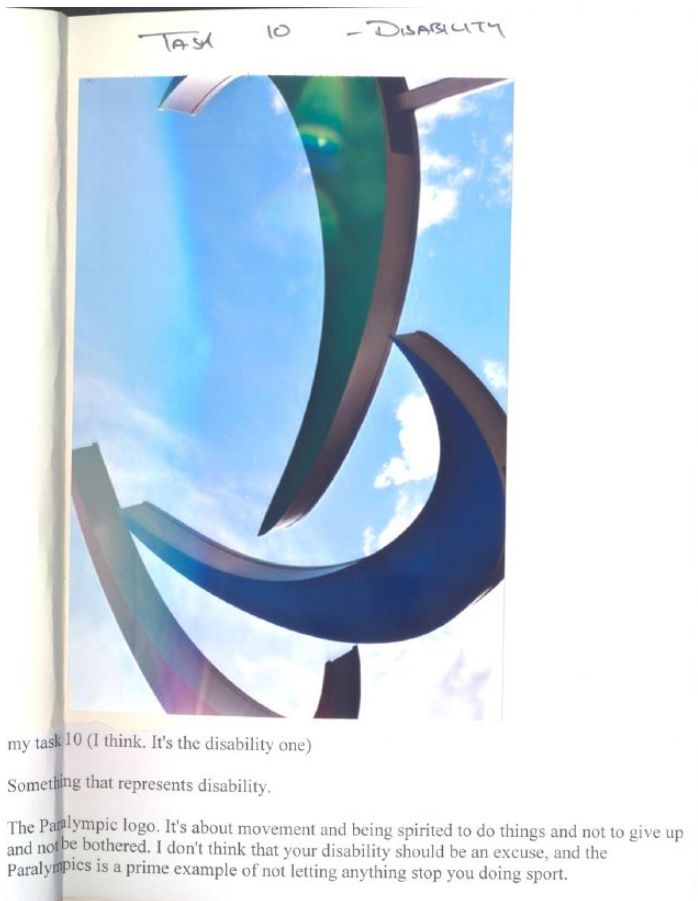
Figure 7. Kate, photo journal. Text reads: 'It's about movement and being spirited to do things and not to give up and not be bothered. I don't think that your disability is an excuse and the Paralympics is a prime example of not letting anything stop you do sport'.

addition, their shared aim was to challenge a prevalent representation of disability: that of the passive, dependent figure. Within their visual accounts of the active subject, their narratives varied, indicating there are different ways to frame and enact what being such a subject involves. What we want to do here is discuss two different active subjects that emerged in the accounts of Kate (15) and Mark (17): 1) the attractive female teenager, 2) the aggressive disabled sportsman. In doing so what we want to do, as well as capture their vivid accounts of their active and valued lives, is to explore the importance of existing visual representations and associated social values in how they did so.