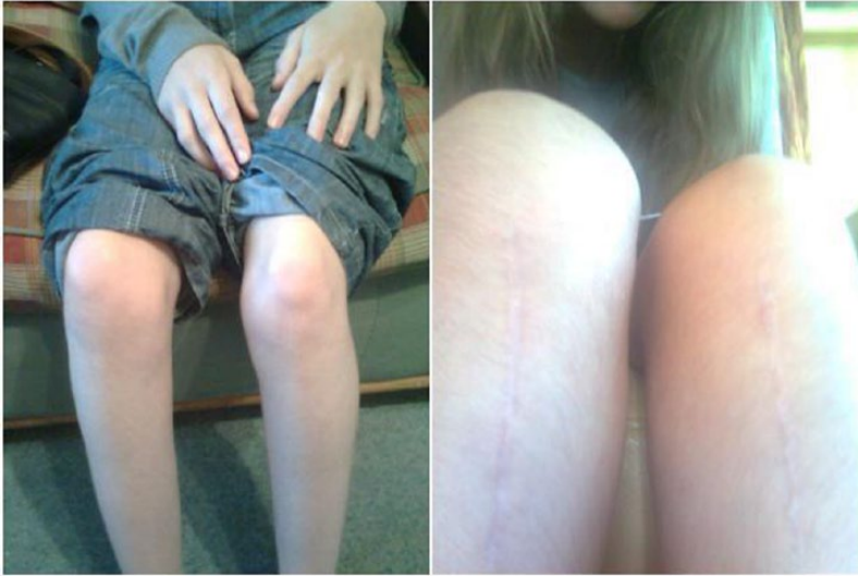
Figure 3. Kate's legs before and after surgery, included in her photo journal.