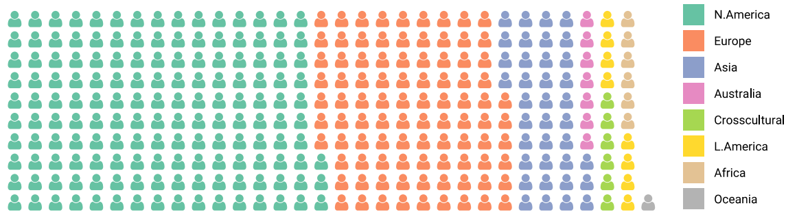
Fig. 1 Origin of samples. N. America, North America; L. America, Latin America and Caribbean