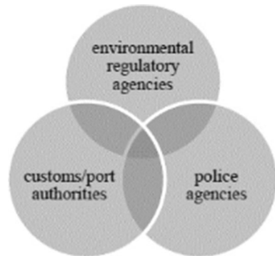
Fig. 2 The core agencies involved in combatting transnational organised crime (Pink 2013a: 3)