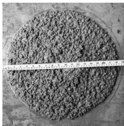
Figure 1. Slump flow.

The Define Slump flow test is essential basic test which gives the indicator of flow ability of SCC. The slump flow results of both mixes are summarized in Table 2. The slump flows of these two mixes were within the range of 550-850mm which complied with the requirement of European guidelines (EGSCC, 2005). Both mixes were classified as class SF 2 as their slump flow values fall within the range of 660-750mm. Typical slump flow was shown in Figure 1.